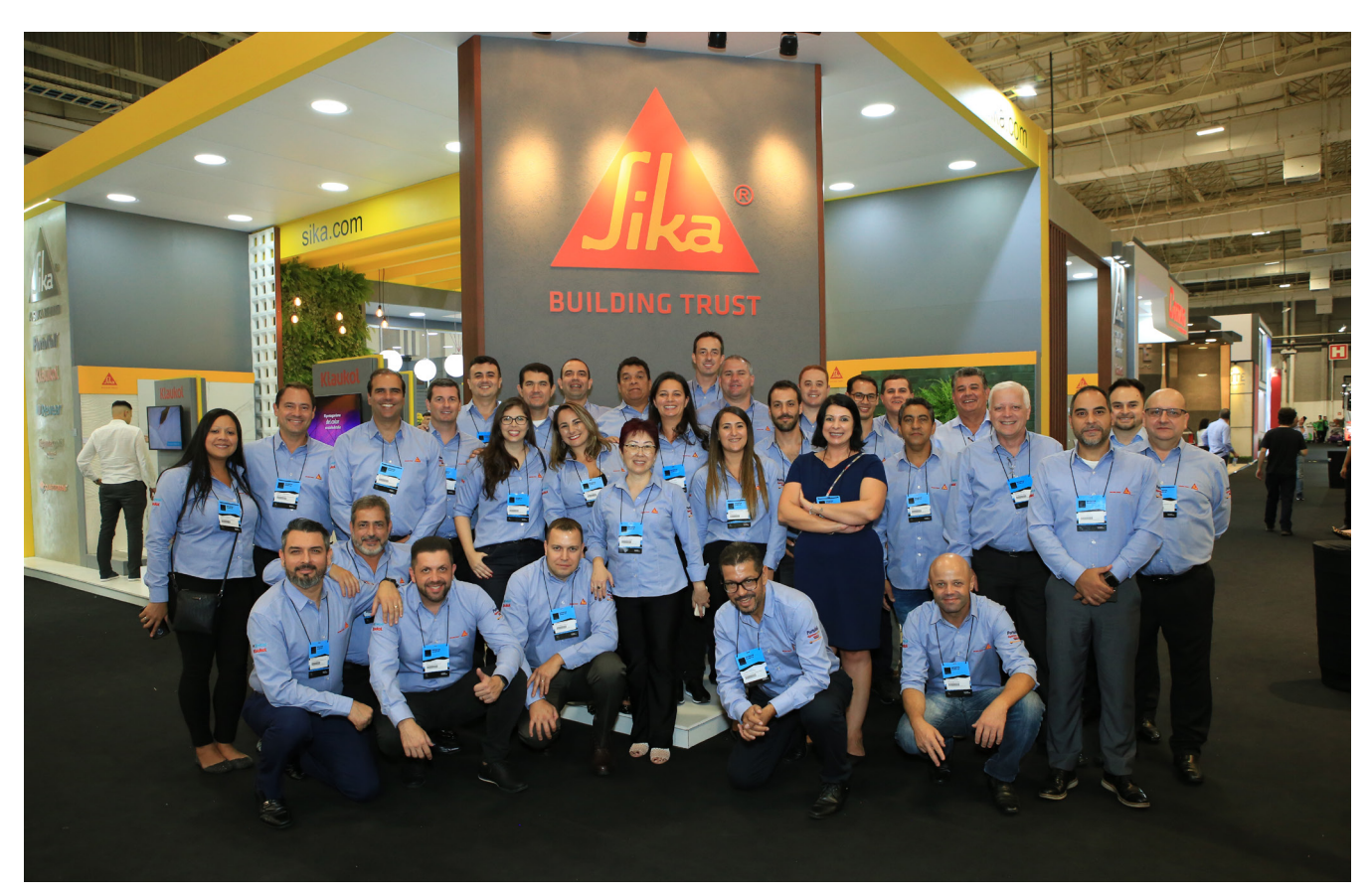
Sika and Parex teams from Argentina and Brazil worked together at the Revestir Expo. the major trade show in Brazil for architects and contractors

Customers are excited to have access to a wider range of construction solutions through a one-stop shop. We can see customers placing orders across the combined product lines. In fact, they also see it as an opportunity to expand their business activities.