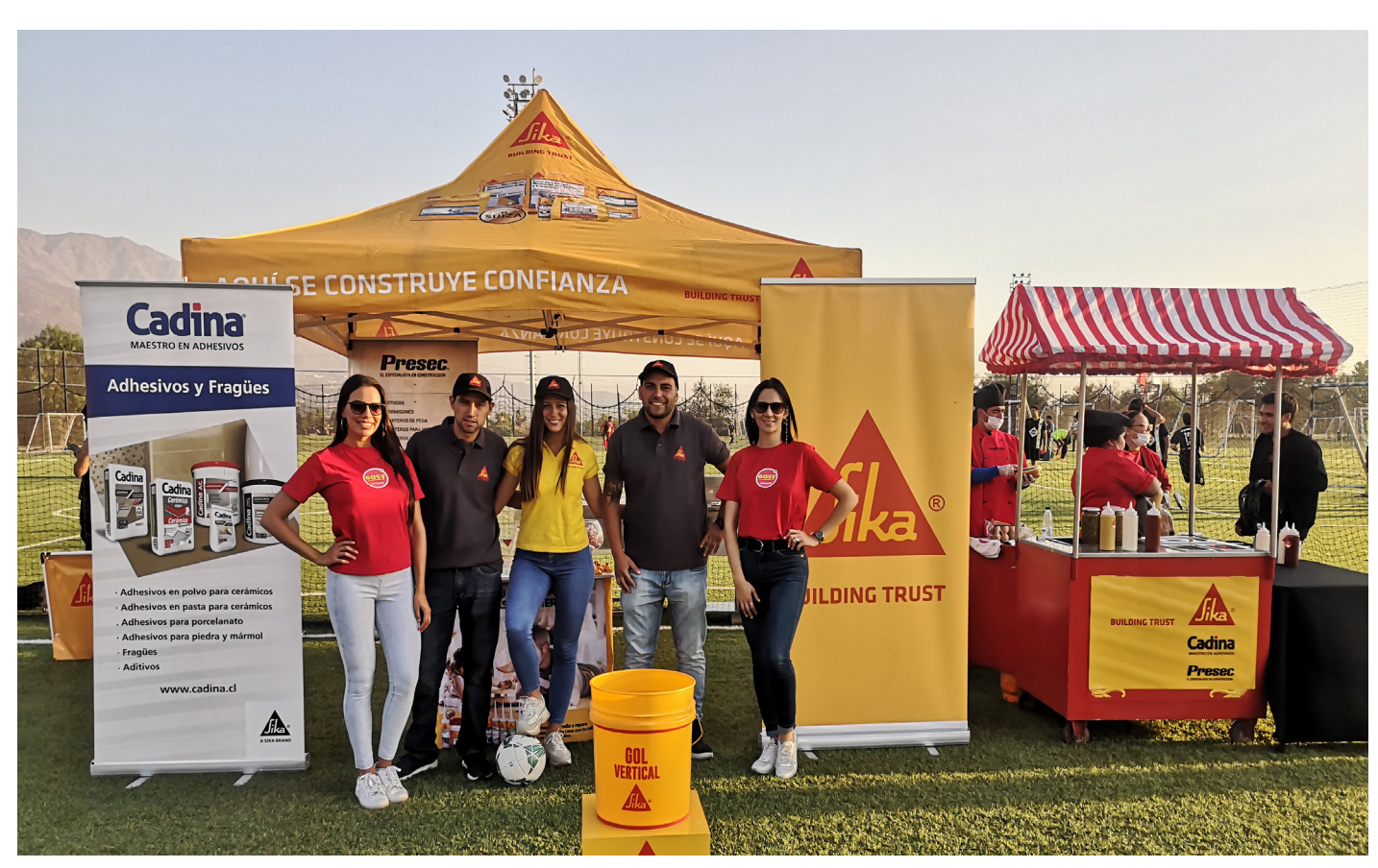
Sponsorship of a local football tournament organized by Easy, a major DIY distributor, and attended by their contractors and end-users