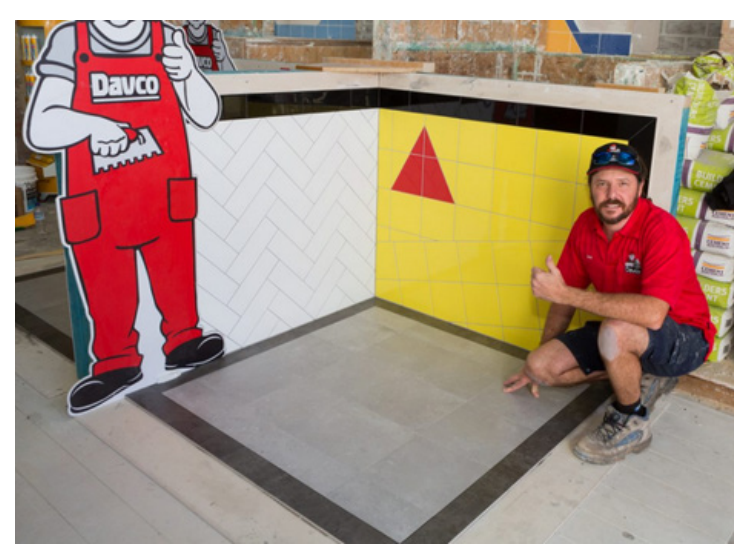
Tiler contest held in Sydney, Australia, in September 2019

At Sika we value tilers and aim to promote their talents and expertise, knowing that a successful project is a combination of a good product and a skillful applicator. Sika's distribution footprint within our 100 countries, combined with the experience and expertise of Parex with its close to 100,000 tilers trained worldwide each year, is supporting and driving efforts to bring the skills of the tilers to the next level.