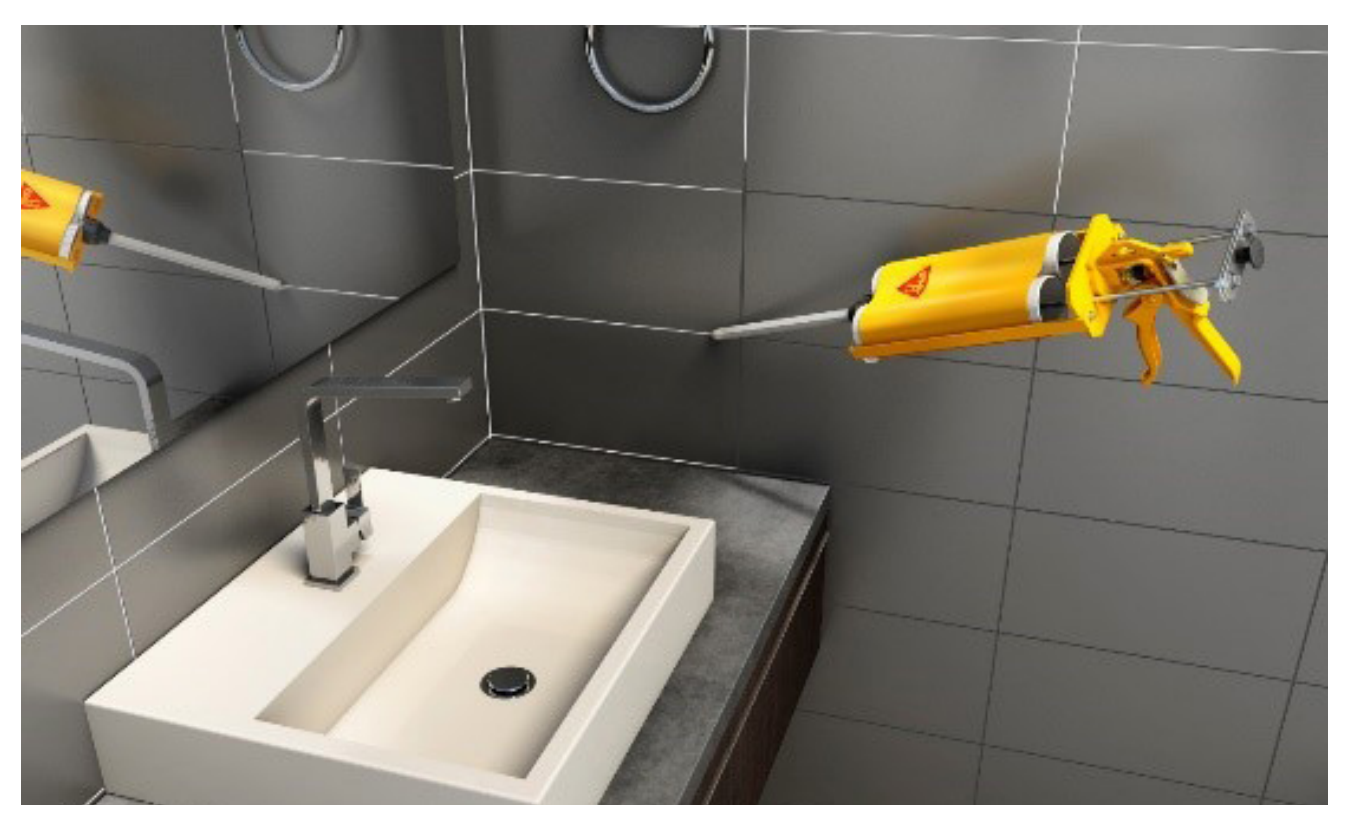
The new epoxy tile grout - easy application for an outstanding decorative result