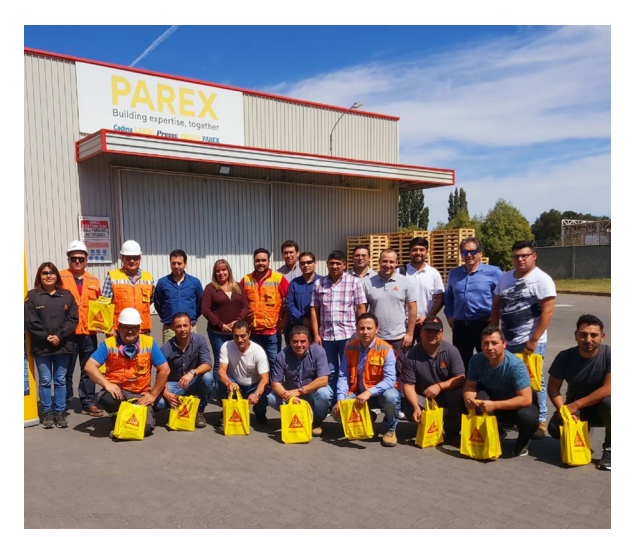
Training for Sika customers at the Parex plant

With regards to administration, we are working hard to consolidate the two companies into one legal entity by including We were able to define the right action plans and to alo-Parex into Sika ERP. This process is ongoing, and we expect to finish by the end of Q2 2020. This ERP integration will strengthen the "one company" spirit operating under one system.