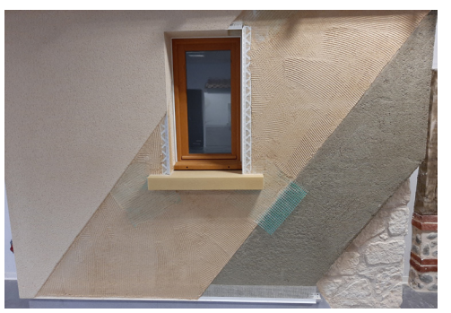
PARNATUR® is designed to lower the use of cement in construction and to reduce CO_2 emissions