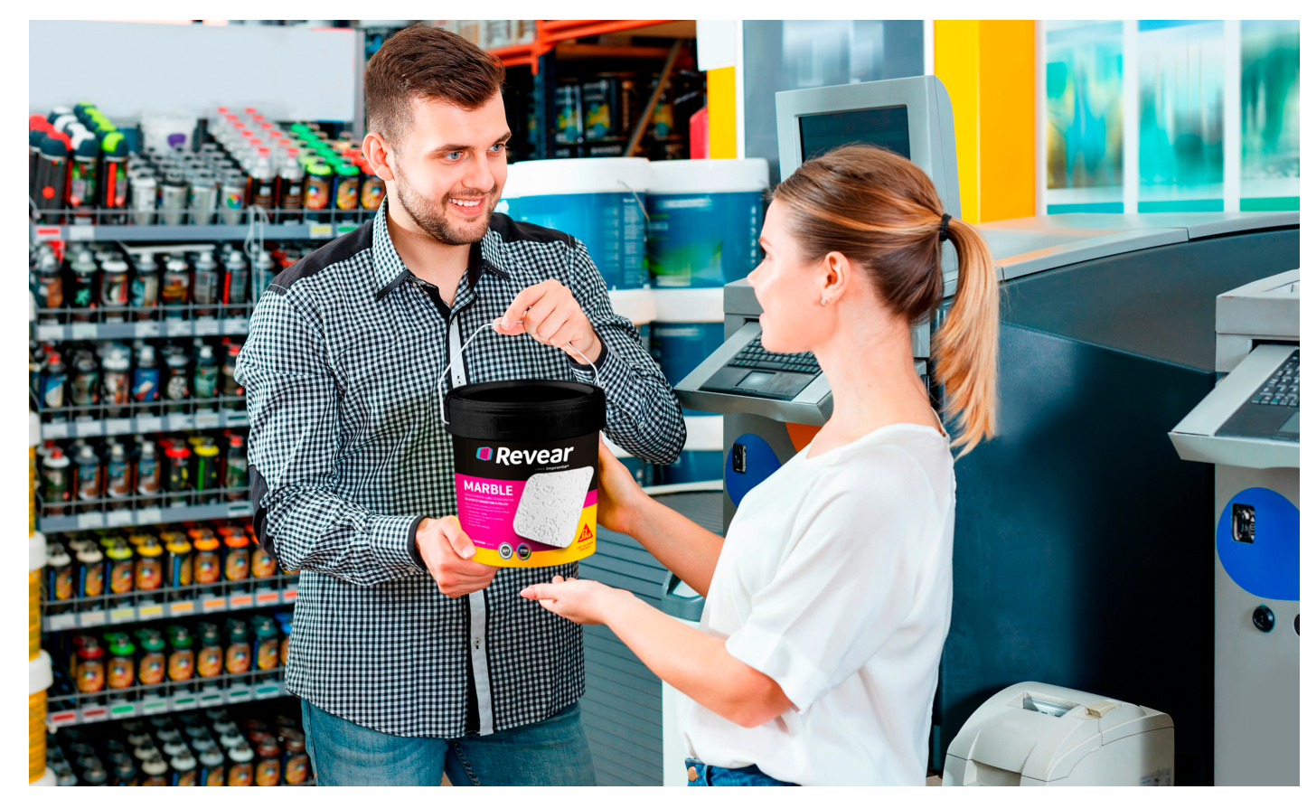
Revear, a strong brand in Argentina in the paint business, specialzing in textured

With the acquisition of Parex, 38 brands were added to the Sika portfolio and their internal integration has already begun. Over the next five years, most Parex brands and products are going to be integrated into Sika's product range. The next step is to plan and ensure a smooth transition "on the shelf".