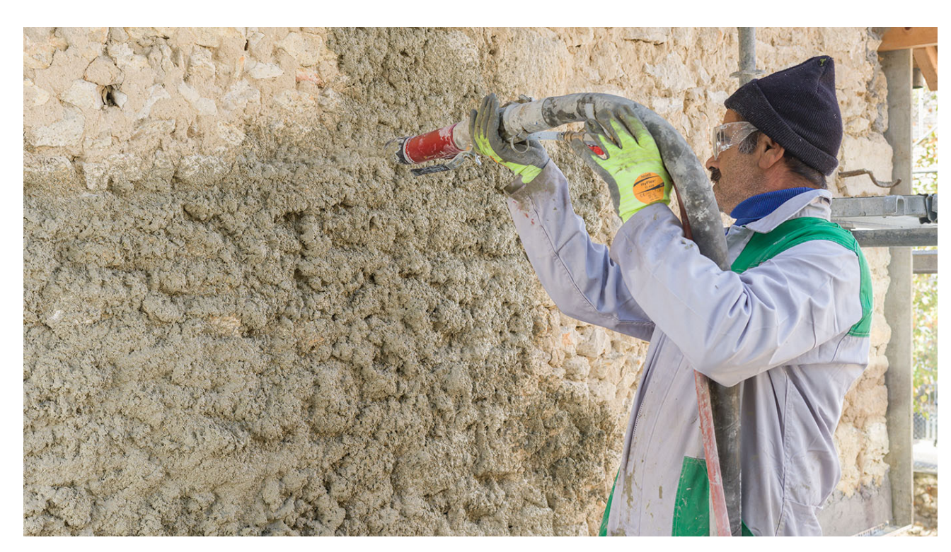
PARNATUR®, the first "easy-to-spray" thermal and phonic insulation hemn-based mortar