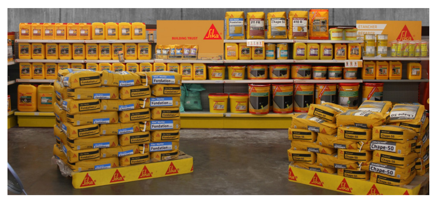
Sika shelf presentation for French distributors