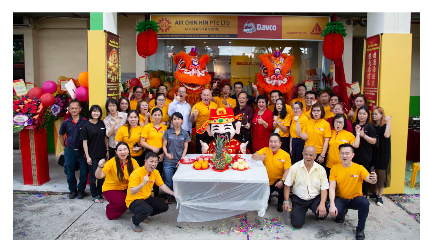
Official opening of the Golden Store, February 2020