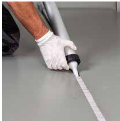
SEALING AND BONDING